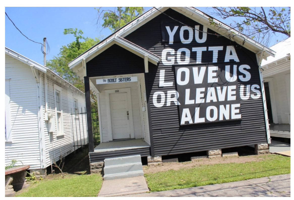
Image Credit: Project Row Houses: Round 46 (Black Women for Black Lives Matter), Houston, TX, 2017

Does Contemporary Art have the capacity to catalyze, counter, exploit, negate, amplify, or capitalize on the phenomenon of gentrification? Within other BLOCC modules, we have explored the correlation between an unregulated art market and the implied protocol of being an artist who is both untethered, yet bound to a series of unspoken codes and economic conditions which feed back into a compounding system of gentrification. In this module, we will discuss the creative strategies artists employ to generate artwork centering on the theme of gentrification and displacement. We will address the problematics of representing gentrification, the aesthetics of organizing as art, the efficacy of art as political tool, artist as developer, and the limits of creative production as proposition. Central to this module is the artwork and artist's positionality, which we will examine beyond the artist's good intentions.