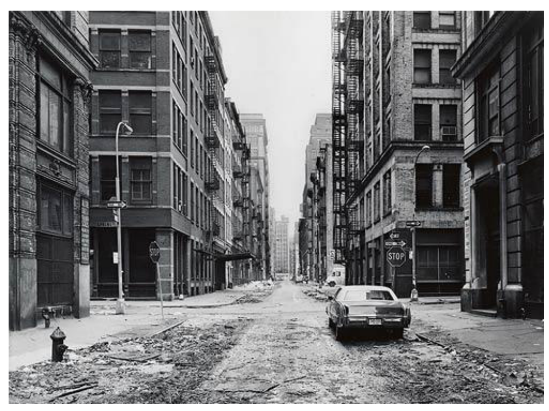
Crosby Street & Spring Street, SoHo New York, 1978.

Since the 1980s, in cities across North America, artists have often been thought of the 'footsoldiers of gentrification', but how did this perception come to be, and is this a perspective shared globally? This module will approach the topic at hand by first outlining some of the political and economic issues globalizing cities are faced with. By learning about the forces that shape our cities, we will come to understand the ways the artistic field has been caught in the fast moving wheels of urban change. After addressing the North American context as one important example among many, we will then move through a number of case studies from the last few decades, in cities such as New York, Rio de Janeiro and Berlin, to understand where the artistic field has intersected with the larger forces of urban displacement, and will outline places for intervention within this dangerous dynamic.